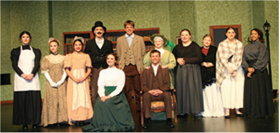
The cast of Pygmalion.