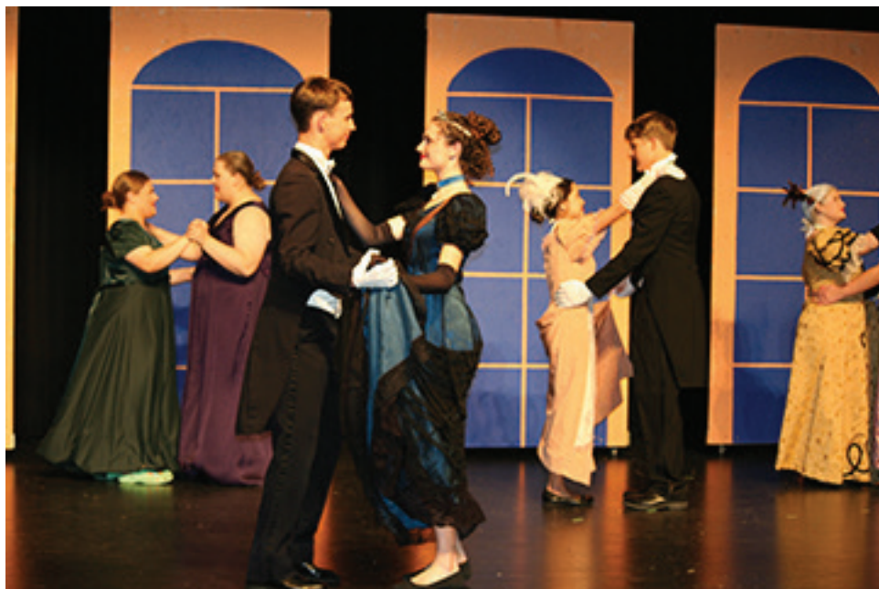
Professor Higgins and Eliza at the ball.

Both performances were well attended by the community, who laughed throughout the shows. The cast and crew glowed with the comments and compliments bestowed upon them at the close of each night.