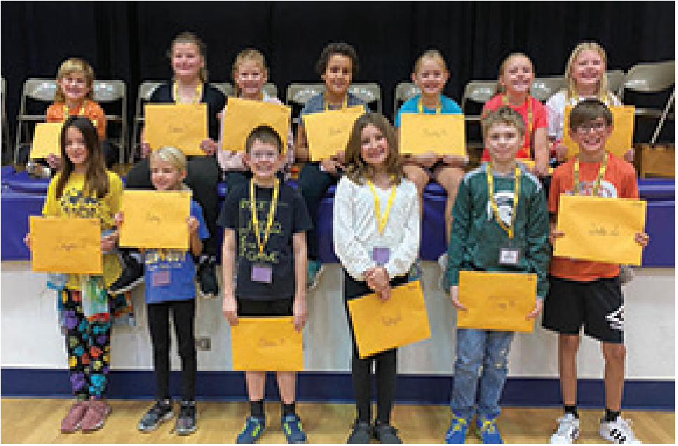
Star Students for the month of October demonstrated self-direction.

Congratulations to our November Star Students who were recognized for demonstrating outstanding teamwork.